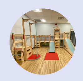
The Playroom Private playdates are available, info at lomastro.com

This year our production will be different, but no less exciting! Learn more on page 2.